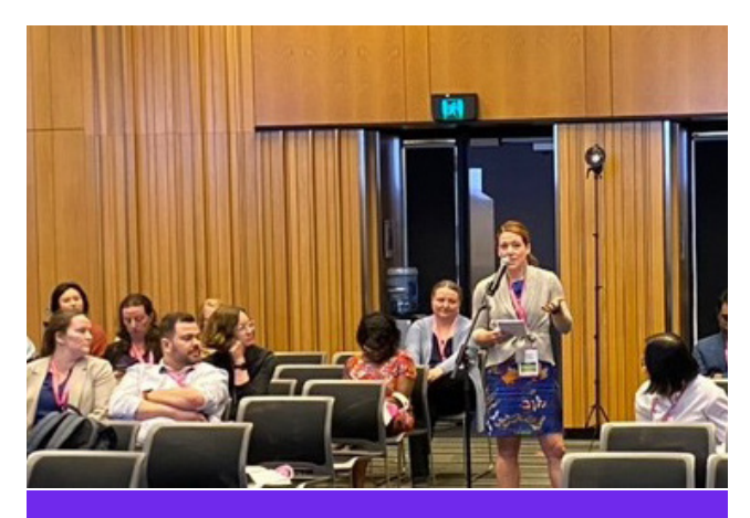
Questions from the audience at the 2023 Annual Meeting of the Society for Reproductive Investigation (SRI) in Bri<u>sbane, Australia.</u>

I was incredibly encouraged by the participants' questions and thoughtful replies of the fellow panelists. They tackled tough problems of mentormentee relations; how to set-up a productive research collaboration; how to maintain clear communications; and critically, when to recognize the natural end and gracefully exit a collaboration with good relations intact.